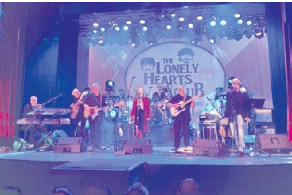
Lonely Hearts Club, a Beatles tribute band, will perform on the Courtyard Stage Saturday, Sept. 2 at 5:30 p.m.