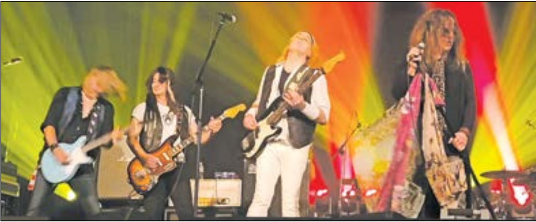
Sweet Emotion, Aerosmith tribute band, will perform Saturday, Sept. 2 at 8 p.m.

Band (Big Band, Jazz, Swing, Blues) 4:00 p.m. Wholesale Band (Rock) 5:45 p.m. The Sound Guys (Classic Rock/Harmony Duo) Fair Closes at 7:00 p.m.