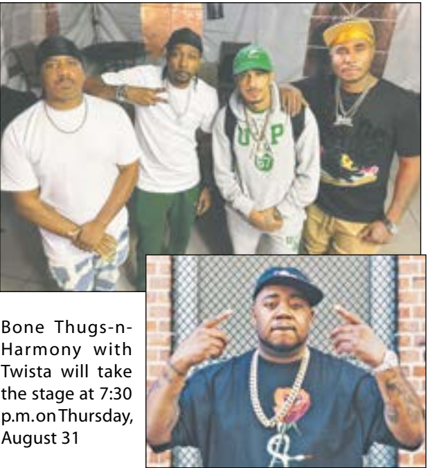
Bone Thugs-n-Harmony with Twista will take the stage at 7:30 p.m. on Thursday, August 31

Learning guitar at 13, Garth Brooks, Elvis Presley and Bob Seger were among those informing his powerful, fire-from-within vocals, while Michael Jackson made