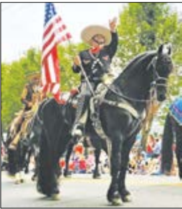
Arts Center, 639 West Main Street.

The Market will be from 9 a.m. to 1 p.m. at the Wagner Performing