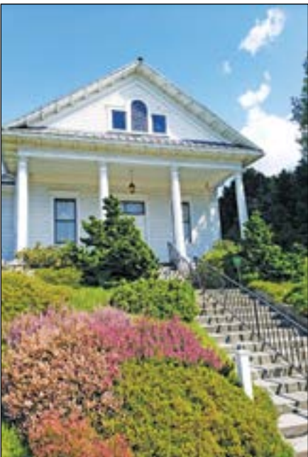
Tim Noah Thumbnail Theater is located at 1211 Fourth Street in Snohomish.

Visit www.thumbnailtheater.org for events and other information.