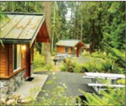
Cabins are available for rent at Flowing Lake County Park.