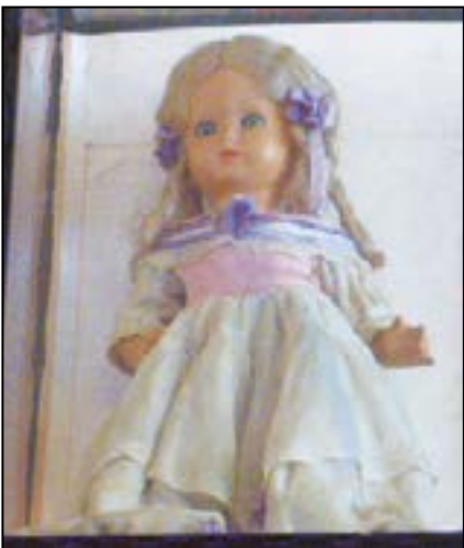
The creepy doll at the Oxford Saloon and Eatery in Snohomish.

Spirits linger around every corner of the Historic District downtown. While shoppers bustling through may not see the town's haunted history, some residents know the unworldly inhabitants by name, while others know them by their chilling touch.